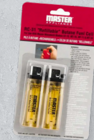
35319 Replacement Fuel Cell